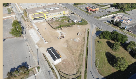
Renovated ECE Playground and curb parking along Douglas Street.