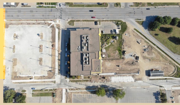
View of new parking lot, CSI's main building, and renovated ECE Playground.