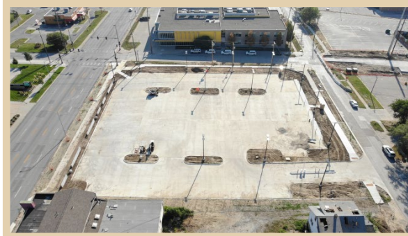
New parking lot located west of CSI's main building.

We are deeply grateful for the unwavering support and dedication from the community. Our mission of nurturing and protecting the youth of today, and tomorrow, can continue on with your generosity. Your tireless efforts have been detrimental in shaping a brighter future for countless children and families near and dear to Omaha who have relied on us for support.