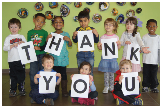
CSI's Early Childhood Education (ECE) children say "thank you."