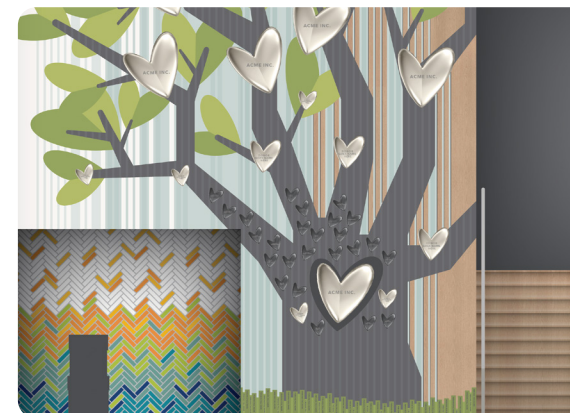
Future donor wall inside the main CSI lobby.

If you give $5,000 or more within the next 60 days, your name will be permanently honored on our donor wall, proudly displayed in the new building's lobby.