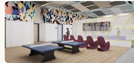
Renderings courtesy of TACKarchitects.

Your support makes stories of hope possible.