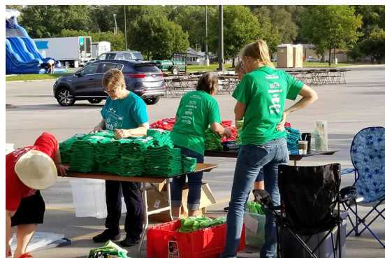
We couldn't be happier to bring back Touch-A-Truck in 2022. Our Guild plays an important role in making this event a success!